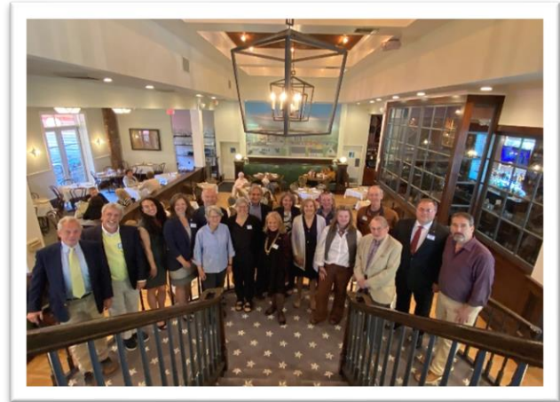
Above: Current and former elected officials Below: Great turnout! A mix of members and elected officials (some of whom are also members!)